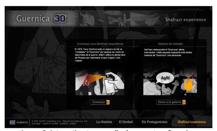
Image 1. Interactive, transmedia documentary Guernica http://www.tv3.cat/3ominuts/guernica/home/home.htm

This documentary is notable for its combined use of different mechanisms: besides presenting a totally reticular hypertextual structure, it offers a large multimedia load and employs discursive techniques like the integration of languages and formats. Similarly, it makes use of techniques from videogames that enable the user to enter the concrete situation, such as recreating the painting. In this sense, it is also a collaborative documentary, which the public can access in order to contribute something different to the theme.