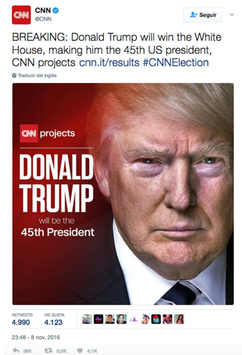
Figure 1: Example of hashtag (#) use from @CNN (8 November 2016).

- Link. Twitter allows users to link in a short manner (23 characters) any type of digital content: information, opinion, entertainment, etc. This mechanism, also similar to the idea of responsiveness, is really appropriate for the coverage of current political issues, allowing journalists to set a direct connection to both their own or external messages.