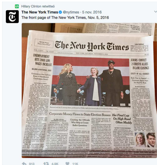
Figure 4: Examples of retweet (RT) use from @HillaryClinton (5 November 2016).

- Mention (@). This mechanism allows a direct appeal to any user, integrating the user’s name (@user) into an own tweet. It can be used as a mechanism for informally initiating a digital conversation with known or unknown users. Different mentions (@1, @2, @3, etc.) can be included in the same tweet. In this regard, it is the most appropriate, direct and complete interaction tool available on Twitter. This mechanism is a public invitation to digital dialogue, with enormous strategic utility for political journalists. Having a flexible use, among its main usefulness we can mention the possibility to include actors in the news and to approach expert political sources to ask them questions, to make public clarifications to all institutional actors, and even to attempt to monitor controversial aspects of its own management.