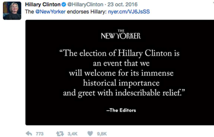
Figure 2: Example of link use from @HillaryClinton (23 October 2016).

- “Like” (♥). This mechanism makes it possible to positively assess the content of a tweet in a very direct way by merely a click (appreciation, interest, etc.). A small heart represents it, and similarly, it is possible to undo it instantaneously. Different to the hashtag and the link, which can only provide or disseminate information, the “like” has an affective connotation that represents an active journalistic voice –close to the interventionist role– (Mellado & Vos, 2017) in professional practice. Indeed, with this action the journalist gives a sort of endorsement to the political source that gets the “like.” In terms of visibility within the network, its value is still limited but it can help interaction when making preliminary contacts with political sources, showing an interest that can later lead to a stronger interaction or a more complete dialogue on Twitter.