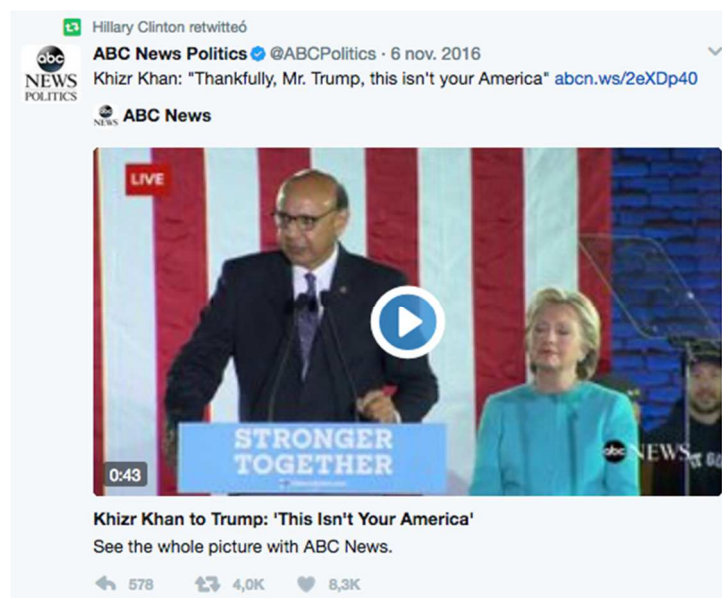
Figure 3: Example of “like” (♥) use from @ABCpolitics and @HillaryClinton (6 November 2016).

- “Like” (♥). This mechanism makes it possible to positively assess the content of a tweet in a very direct way by merely a click (appreciation, interest, etc.). A small heart represents it, and similarly, it is possible to undo it instantaneously. Different to the hashtag and the link, which can only provide or disseminate information, the “like” has an affective connotation that represents an active journalistic voice –close to the interventionist role– (Mellado & Vos, 2017) in professional practice. Indeed, with this action the journalist gives a sort of endorsement to the political source that gets the “like.” In terms of visibility within the network, its value is still limited but it can help interaction when making preliminary contacts with political sources, showing an interest that can later lead to a stronger interaction or a more complete dialogue on Twitter.