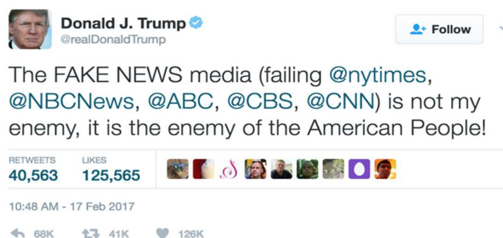
Figure 6: Example of digital interaction between @realDonaldTrump and different media that generated 68K replies (17 February 2017).

- Dialogue. Finally, as the most dynamic interaction mechanism on Twitter, we find the digital dialogue between different users, which is represented by the exchange of at least two tweets with mentions between media / journalists and political actors. Although empirical studies to date show a very limited development of these types of interactions (Noguera-Vivo, 2013; Lee et al. 2016), when they occur they are very significant. If the actors are relevant and the digital dialogue has a certain controversy, there is a high probability that it will become mainstream news. In this interaction, the key factors to analyse are the initiative in the process and the communicative domain in the development of the dialogue. Of course, the use of the other interaction mechanisms (#, @, RT), which make this interaction even more dynamic, can be included in this dialogue.