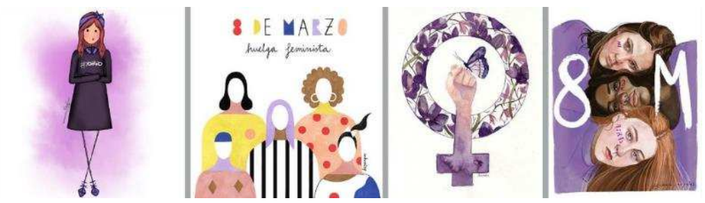
Figure 1: Random selection of four pieces from the sample.

Source: @ilustracionesmaryf, @_depeapa, @marialugili and @chari_nogales.