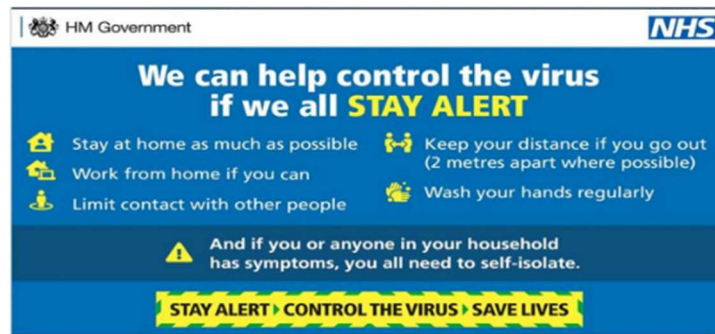
Figure 3. Stay Alert, Control the Virus campaign.