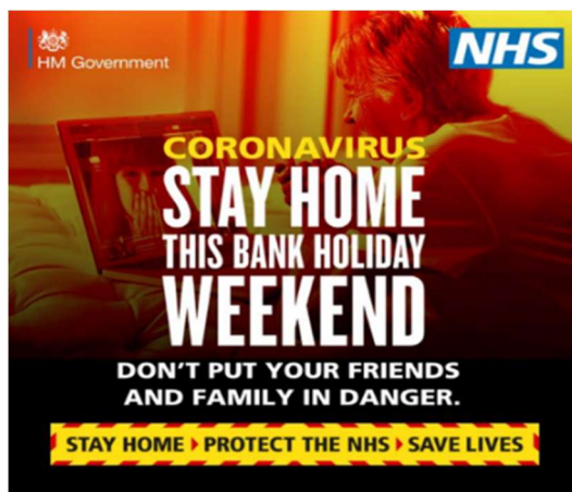
Figure 2. Stay Home This Bank Holiday Weekend campaign.

The interview questions covered largely two areas, that is, behaviour towards COVID-19 campaigns and evaluation of health messaging (please see Appendix for the interview questions). Questions about the participants' motivations to comply with the rules (or not) (e.g., social distancing, vaccines) were designed to unfold their attitudes and beliefs influencing their behaviours. Regarding the health messaging, we focused on the participant's recollection and reaction to the NHS COVID-19 bulletins and their reactions to three distinct campaigns running in the UK between 2020 and 2021, as shown below.