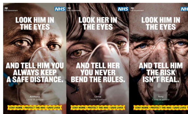
Figure 4. Look Them in the Eyes campaign.