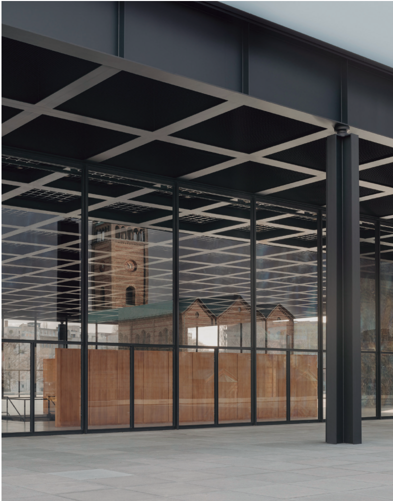
Fig. 01 Ludwig Mies van der Rohe and David Chipperfield Architects. Neue Nationalgalerie, Berlin, 2021.